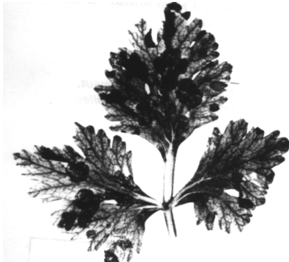
Septoria Blight of Celery

fruiting structures of the fungus (pycnidia) which look like minute black specks develop in the dead tissue of the lesions. Under favorable conditions for infection and disease development, the fungus will penetrate the host and produce visible symptoms in approximately 9 to 12 days. Celery and celeriac are the principal hosts in California.