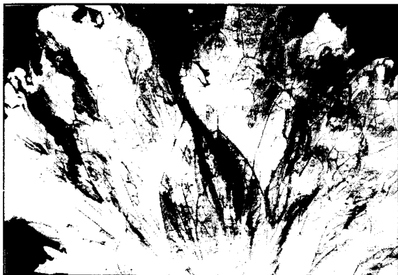
Mildew symptoms on upperside of lettuce leaf.